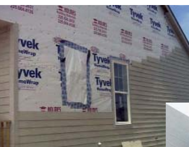
Fiber Cement Siding to Steel