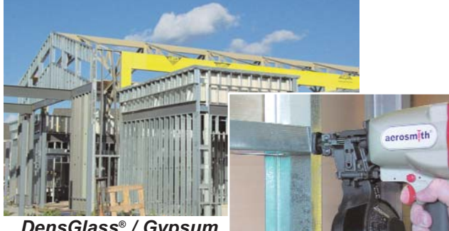
DensGlass<sup>®</sup> / Gypsum Sheathing to Steel