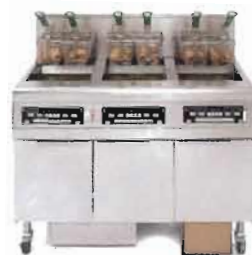
FPGL330 Gas Protector

Saving Potential: >$4,700+ per year/pot!